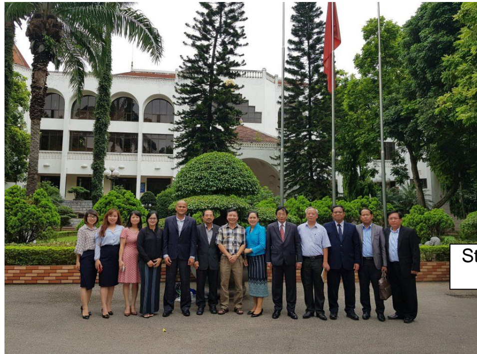
Study Tour for Higher Level Officials held in Vietnam