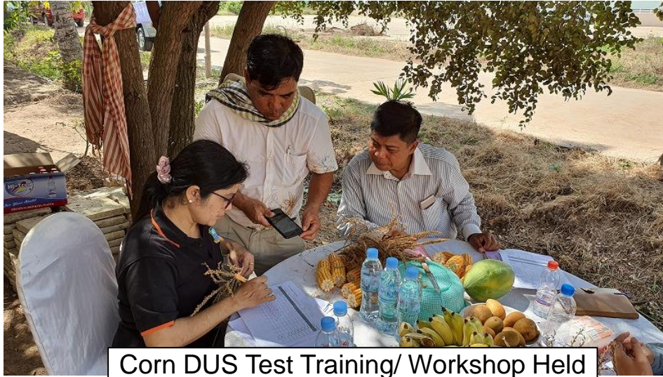
Corn DUS Test Training/ Workshop Held in Phnom Penh, Cambodia